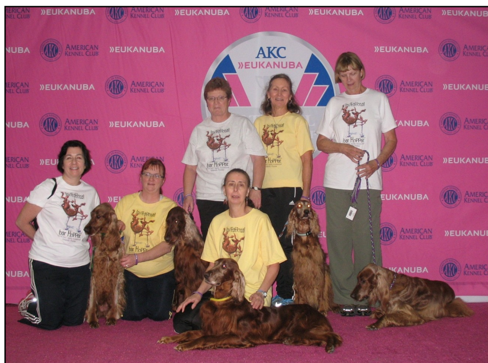
Group shot L - R

Ruby MACH8 Salisbury's Tuesday Red Irish Jewel JH MXB3 MJG3 MXF T2B Brodie CH MACH Galewinns Huntersglen Badlands MXG MJG MXF MFB T2B Sophie MACH4 Redfeathers Saratoga MXG2 MJC2 OF T2B CGC Mia MACH9 Rusticwood Short & Sweet MXS3 MJB4 MXF MFB TQX T2B Skye MACH7 Marlyn A Magic Wand JH MXB3 MJG3 XF T2B